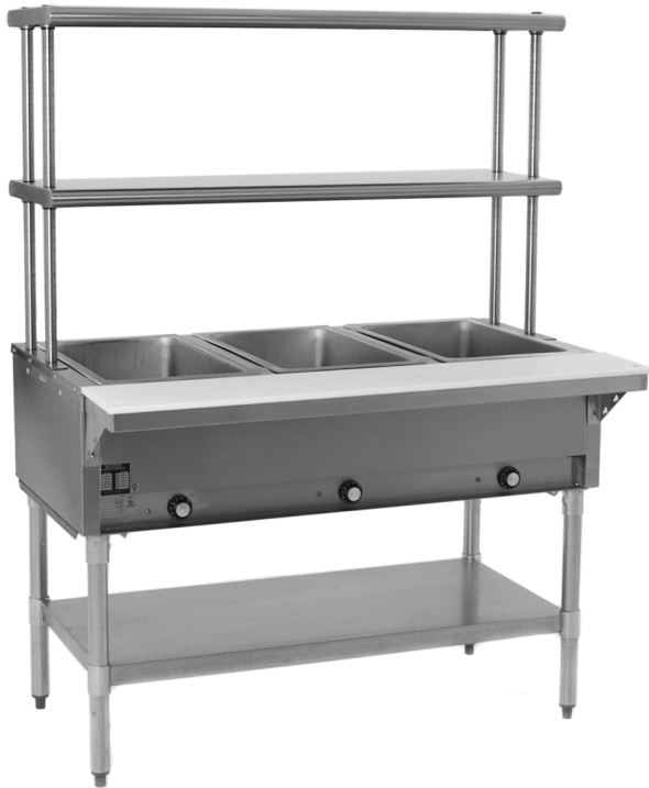
3-well hot food table with Flex-Master® Overshelf System

Eagle Flex-Master® Overshelf System for Hot Food Tables to consist of 10"- or 15"-wide 16/304 stainless steel shelves with tapered collars, adjustable in 1" increments. Shelves come with split sleeves. Posts are stainless steel, with mounting plates included. Optional hooks, pot and ladle racks, and heat lamp brackets are available.