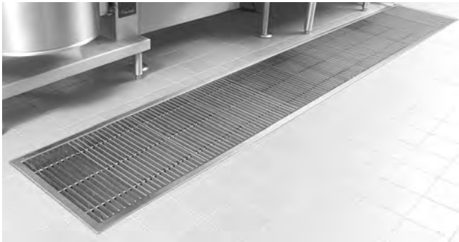
anti-splash floor trough

Eagle Anti-Splash Floor Trough with fiberglass grating, model _____. Unit constructed of 14/304 stainless steel all-welded construction. Patented anti-splash design (patent #D519,618 S) assures complete drainage while preventing splash back onto the floor. Drain accommodates up to a 4"-diameter pipe and comes standard with a stainless steel removable perforated basket. Fiberglass grating to be 1" high yellow polyester material with a non-slip grit surface. Tapered "I" beam construction for ease of cleaning and drainage. Gray color grating available.