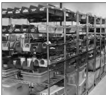
Bin holder rails can also be used on Eagle's Floor-Trak® units*

* For additional information on Floor-Trak® Systems, refer to spec sheets EG01.39A and EG01.39B , or visit us on-line at www.eaglegrp.com .