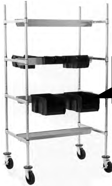
shown assembled as a cart

Eagle Double-Sided Bin Holder Rail Cart, model _____, (EAGLEbrite® zinc, chrome) four bin holder rails with 63" posts, and resilient casters. Unit shipped knocked down.