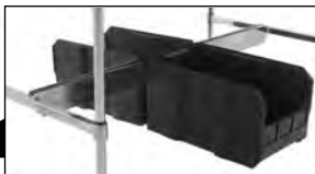
bin holder rail with two bins (bins sold separately - see manufacturer's guide for recommended weight capacity)