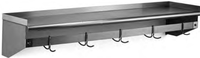
wall shelf with rack

Eagle Wall Shelf with Removable Hooks, model _____. Shelf is constructed of 16 gauge type 430 stainless steel, with 1½" roll on front and 1½" upturn on rear and ends. 2" x ¾" type 304 stainless steel flat bar. Furnished with double-prong stainless steel removable hooks, one every 12".