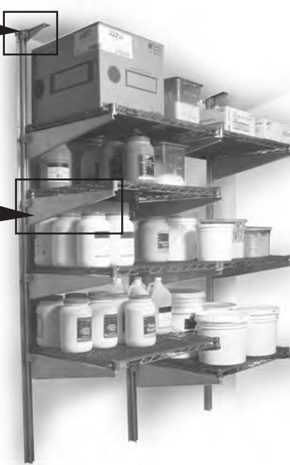
wall-mounted cantilevered shelving shown with wire shelving