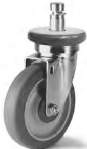
(nickel-plated) caster with polyurethane tread