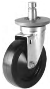
swivel caster with resilient tread

* See charts for complete model numbers.