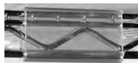
clear plastic label holder for reverse mat shelves