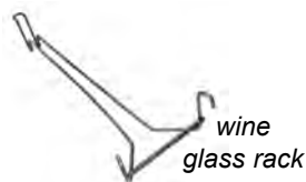
wine glass rack